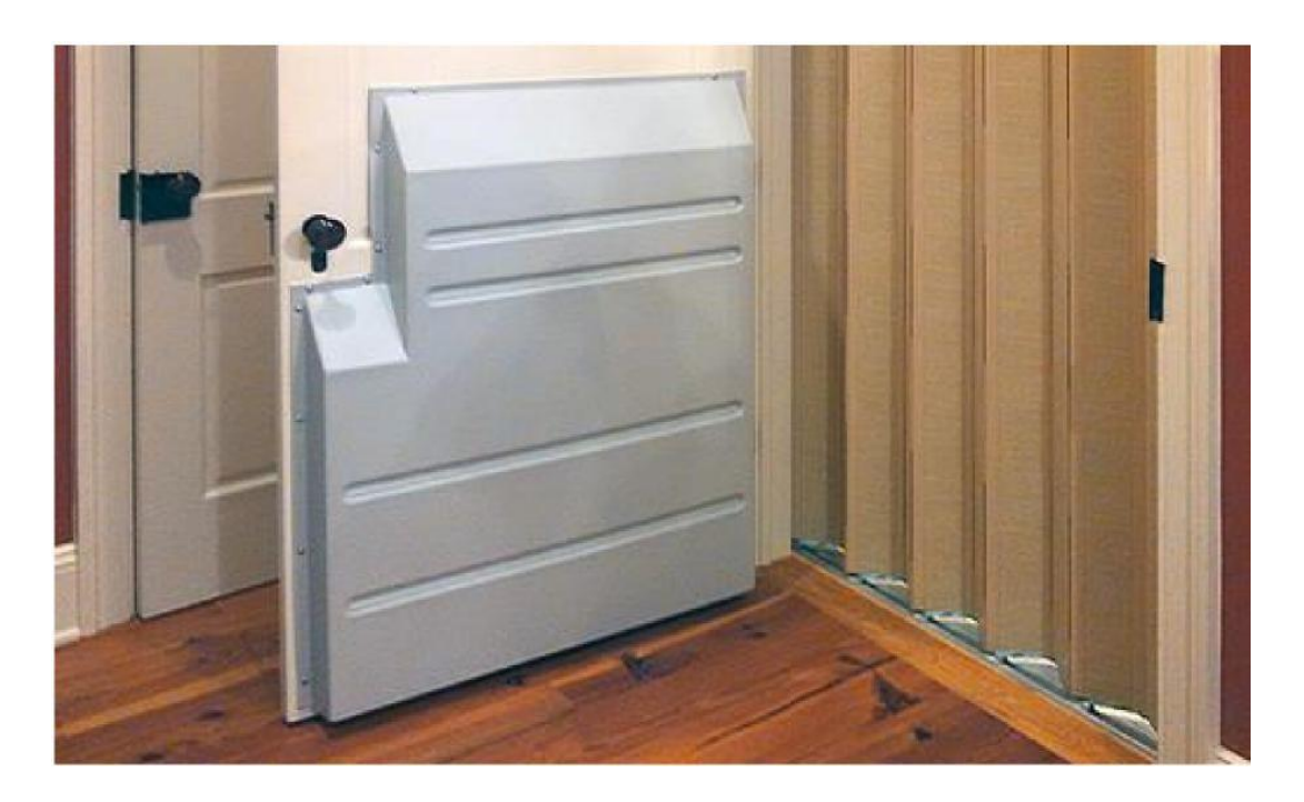
Example of an installed safety device/space guard